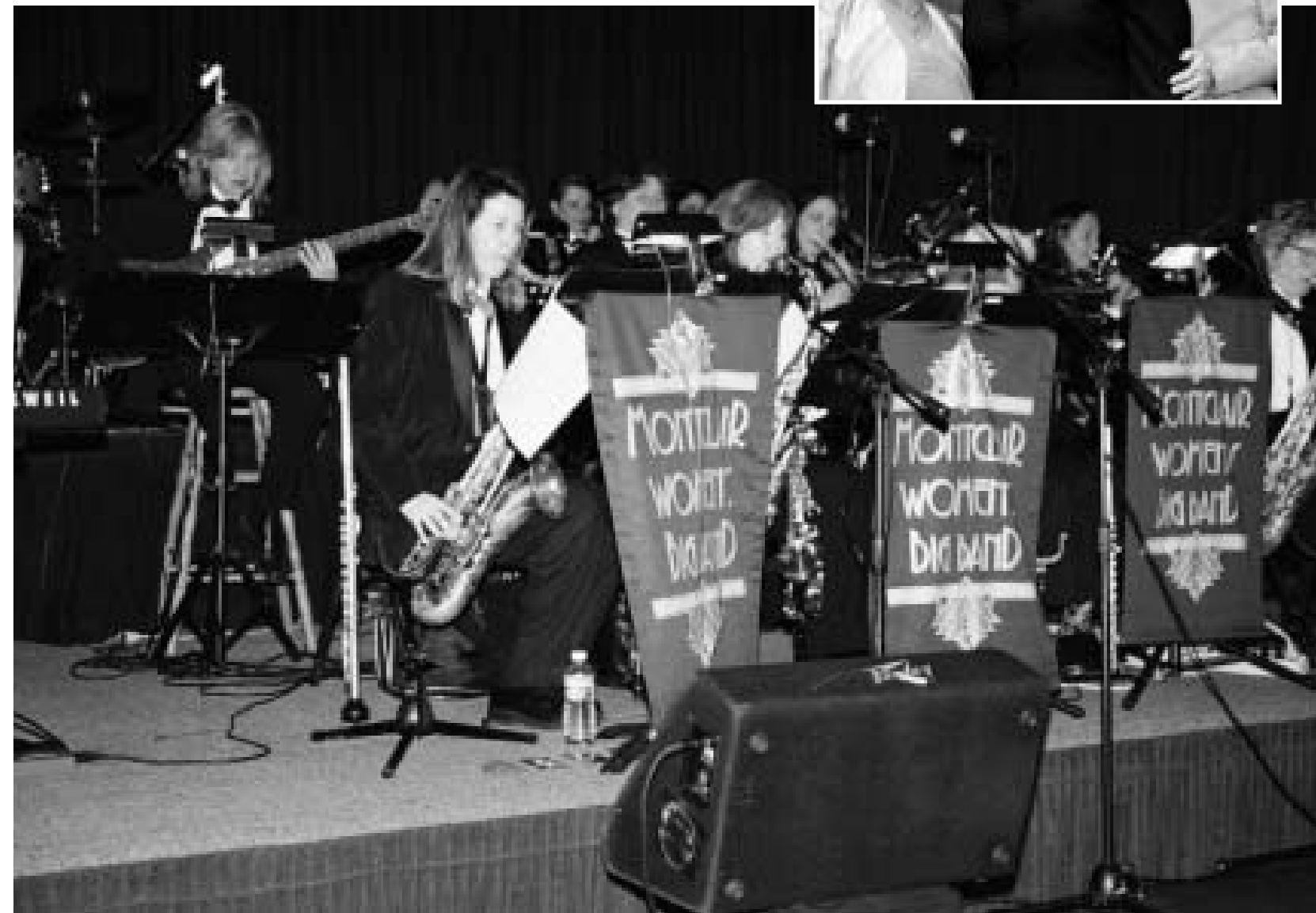
Montclair Women's Big Band.