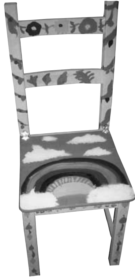
Students in the after school art program at EBAC's Sequoia Family Resource Center created one-of-a-kind art furniture for the Silent Auction. Their beautiful chair and table set was a highlight of the evening.

East Bay Agency for Children (EBAC) got off to a great start on our second half-century with the 7 th Annual Heart of the Matter Gala, "A Celebration of Children." We would like to extend our deep gratitude to all those who helped us mark the occasion with such a successful fundraising event. EBAC raised over $90,000 to support our 10 great programs that serve more than 15,000 children and their families throughout Alameda County.