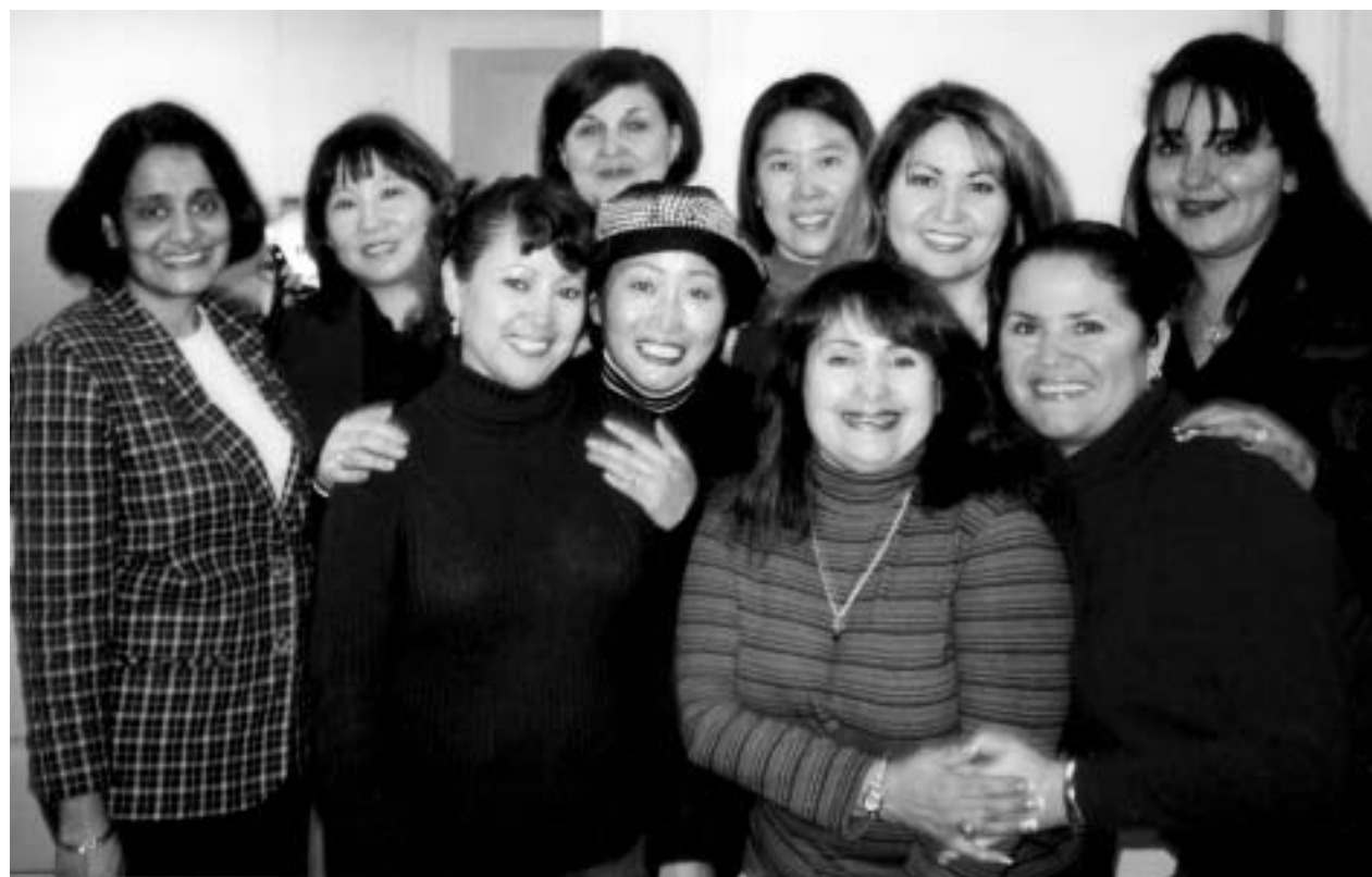
Fremont Healthy Start Staff.

"It's 4:00pm, my workday is done. I can tell I made a difference today, and it feels good!"