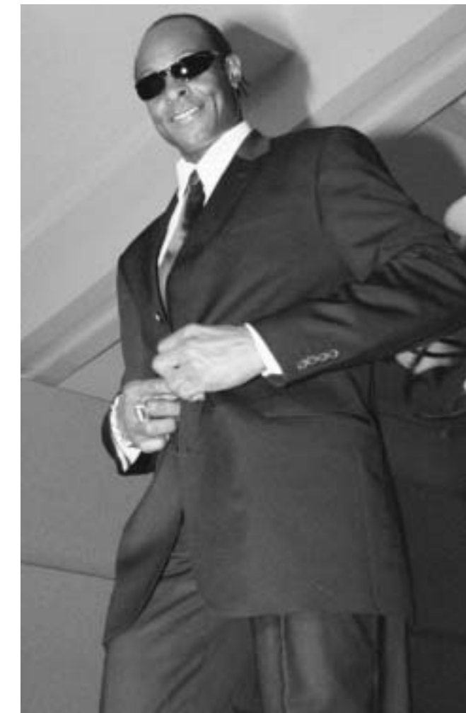
Jerry Rice struts for EBAC.

After an evening of the Oakland Raiders looking